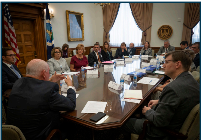
Secretary Sonny Perdue met at USDA with local school officials to learn more about how the Department can best assist and enable their efforts to serve nutritious meals to our nation’s children.

Taken together, these customer-focused changes are intended to help state and local program operators overcome operational challenges while maintaining program integrity, ultimately allowing for more time and resources to be focused on serving children wholesome meals—everyone’s main goal for child nutrition.